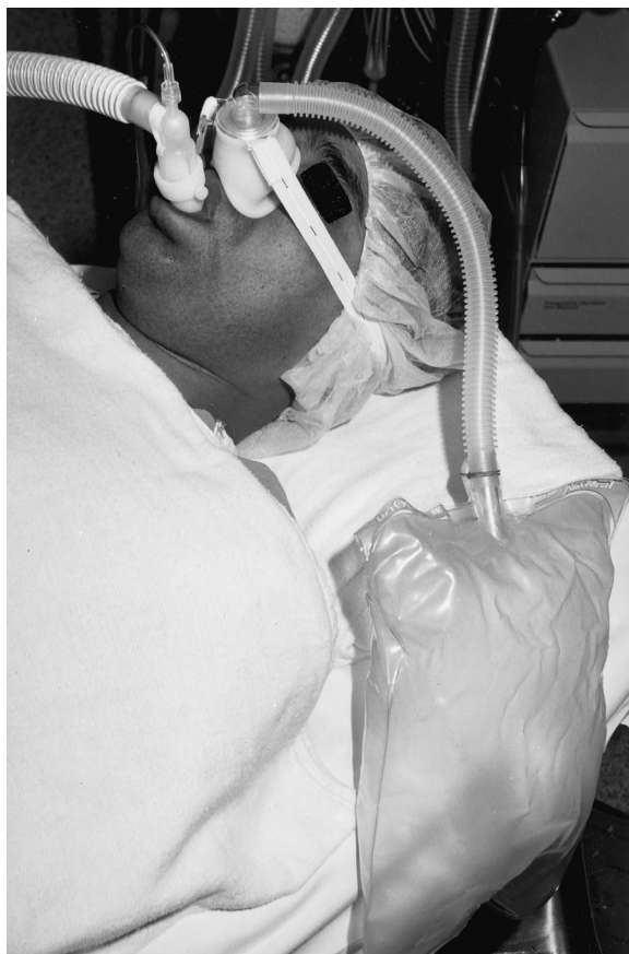
Fig. 1. The NasOral system uses a small nasal mask for inspiration of oxygen from a reservoir bag. Exhalation occurs via a mouthpiece. One-way valves in the nasal mask and the mouthpiece ensure unidirectional flow.

After obtaining institutional review board approval, a total of 20 consenting, healthy volunteers, American Society of Anesthesiologists physical status I (14 men